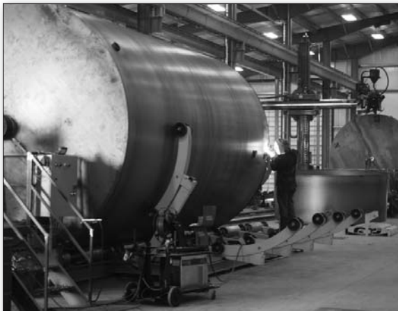
Oil Tank Production at Pro Tank Products