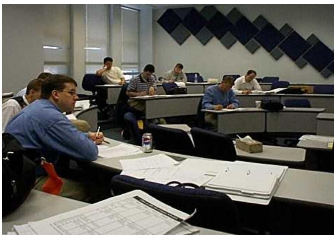
On-campus classes for the students in the Class of 2000 were held in the newest high technology classroom in Waters Hall.