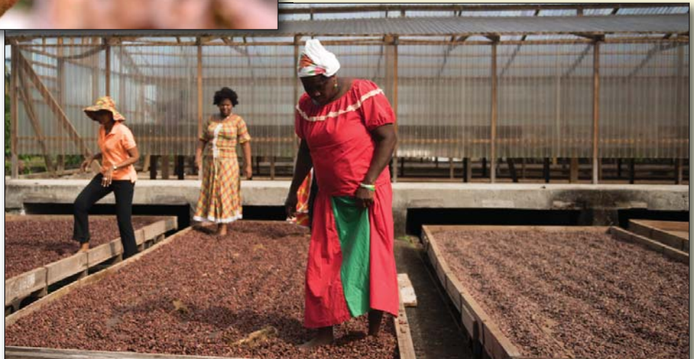
Walking the cocoa at Belmont Estate.