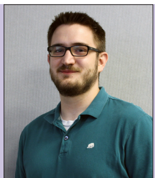
Class of 2021 The Feasibility of a DRP Margin Private Product