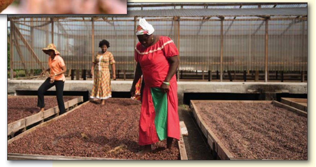
Walking the cocoa at Belmont Estate.

2015 - Belmont Estate was cited by the Centre for Responsible Travel (CREST) in its article "Celebrating Women in Tourism" on the occasion of International Women's Day, March 8th